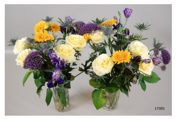
Treatment: Chrysal Clear Fairtrade universal liquid Total vase life: 16 days Photo taken: day 13