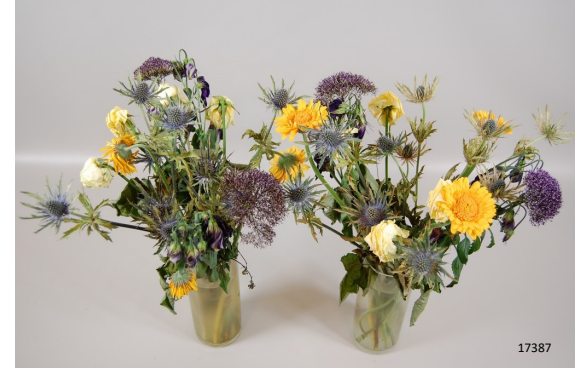
Treatment: water Total vase life: 9 days Photo taken: day 13