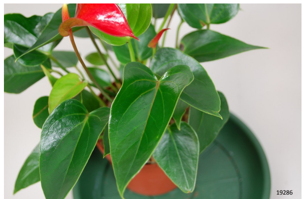
Treatment: Chrysal Leafshine (aerosol) Photo taken: day 12