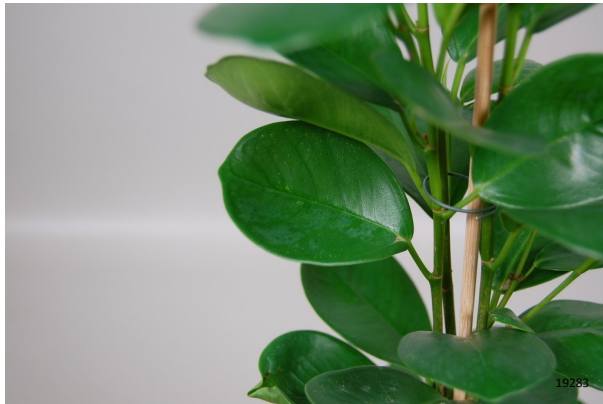
Treatment: none Photo taken: day 12