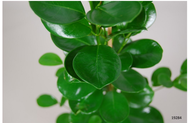
Treatment: Chrysal Leafshine (aerosol) Photo taken: day 12