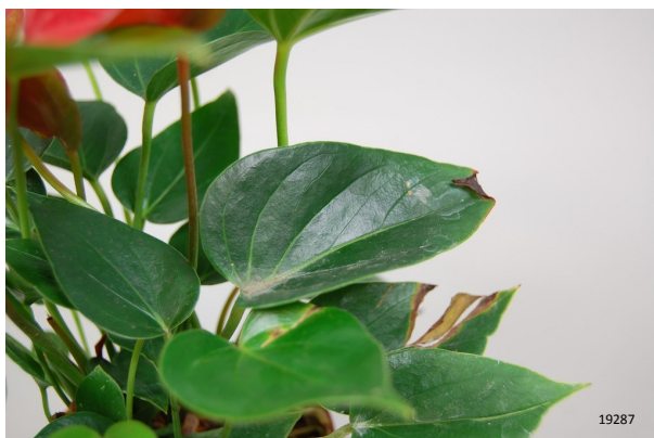
Treatment: none Photo taken: day 12