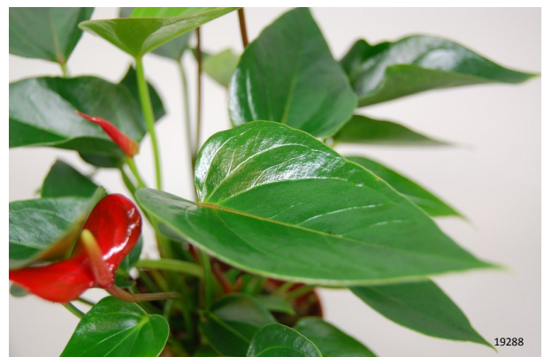
Treatment: Chrysal Leafshine (aerosol) Photo taken: day 12