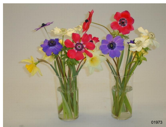
Treatment: Chrysal Clear Narcissus Total vase life: 10 days Photo taken: day 7