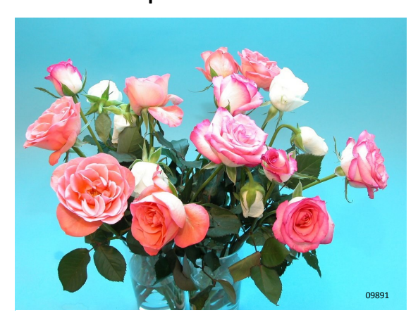
Treatment: water during transport and shop phase / Chrysal Clear liquid rose food during consumer phase

Total vase life: 5 days Photo taken: day 5