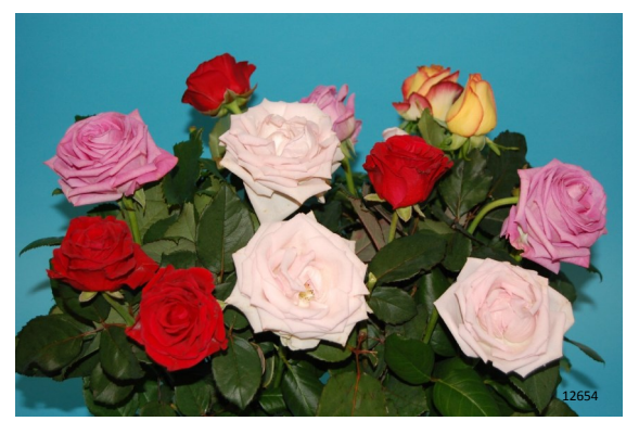
Treatment: Chrysal Clear Professional 2 T-Bag during transport and shop phase / Chrysal Clear cut flower food during consumer phase

Total vase life: 7 days Photo taken: day 7