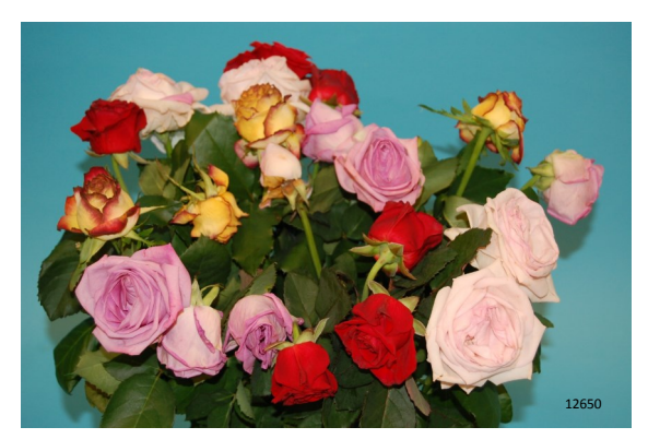
Treatment: water during transport and shop phase / Chrysal Clear cut flower food during consumer phase Total vase life: 3 days