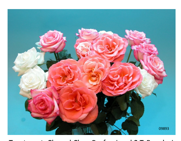
Treatment: Chrysal Clear Professional 2 T-Bag during transport and shop phase / Chrysal Clear liquid rose food during consumer phase

Total vase life: 5 days Photo taken: day 5