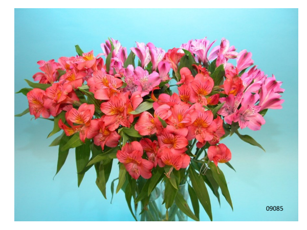
Treatment: Chrysal AVB and Chrysal SVB Total vase life: 15 days Photo taken: day 13