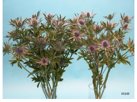
Treatment: Chrysal SVB Total vase life: 16 days Photo taken: day 15

Treatment: water Total vase life: 10 days Photo taken: day 15