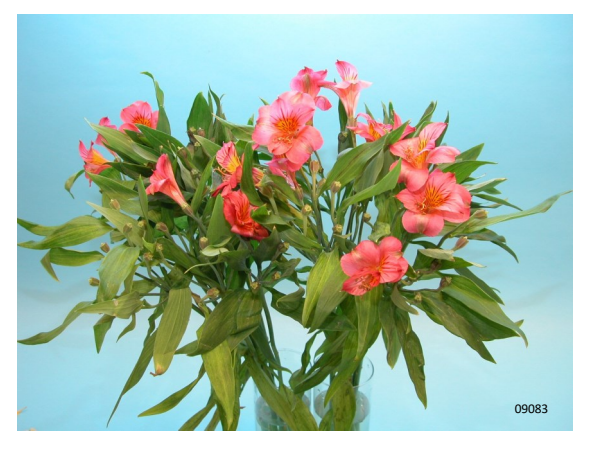
Treatment: water Total vase life: 11 days Photo taken: day 13