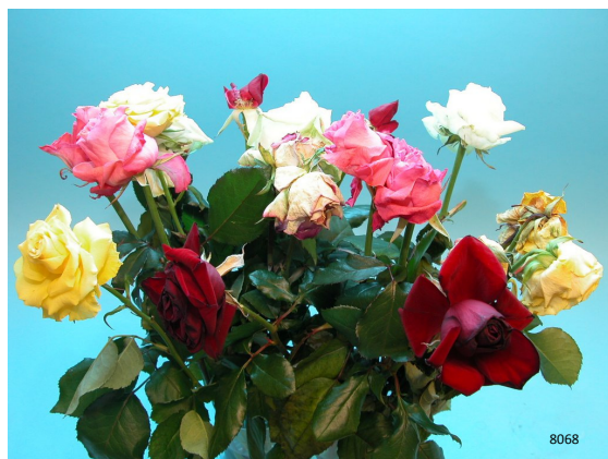
Treatment: water Total vase life: 8 days Photo taken: day 15