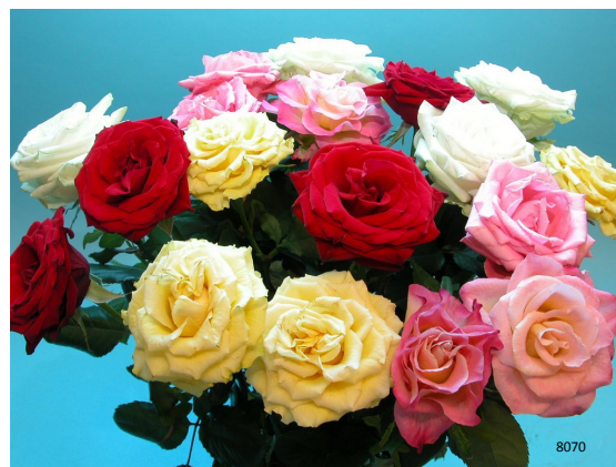
Treatment: Chrysal Clear Rose powder Total vase life: 19 days Photo taken: day 15