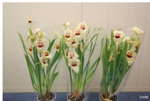
Ethylene Buster® tablets