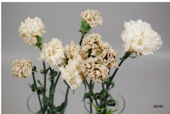
Treatment: none Total vase life: 9 days Photo taken: day 12