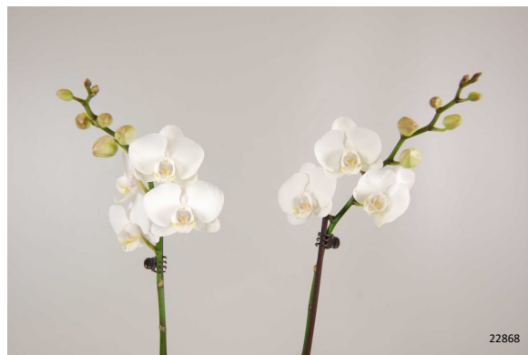
Ethylene Buster® tablets