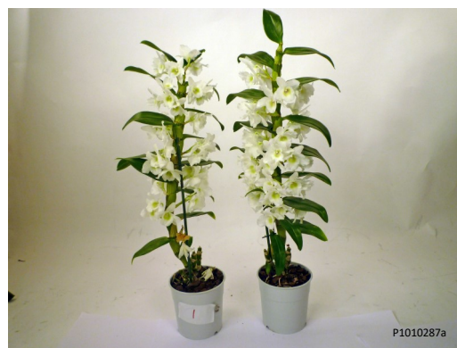
Ethylene Buster® tablets