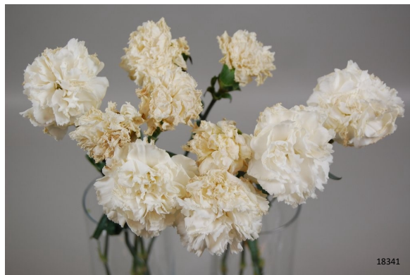
Treatment: Ethylene Buster® tablets Total vase life: 12 days Photo taken: day 12