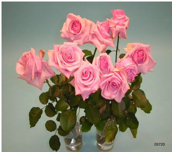
Treatment: water Total vase life: 10 days Photo taken: day 13