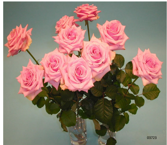
Treatment: Chrysal RosePro Hydration Total vase life: 17 days Photo taken: day 13