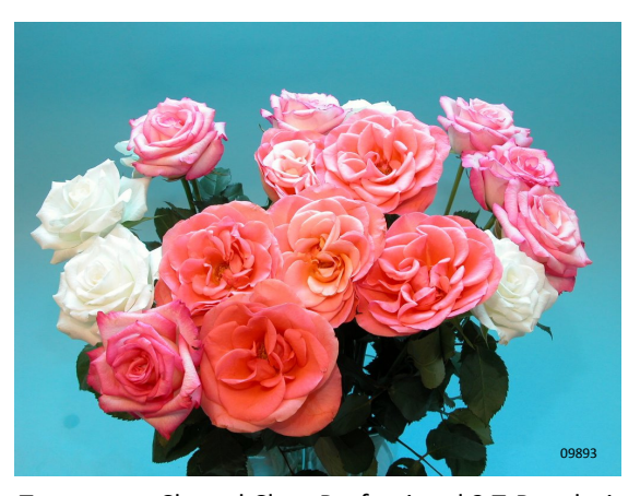
Treatment: Chrysal Clear Professional 2 T-Bag during transport and shop phase / Chrysal Clear liquid rose food during consumer phase Total vase life: 9 days Photo taken: day 5

Treatment: water during transport and shop phase / Chrysal Clear liquid rose food during consumer phase Total vase life: 5 days Photo taken: day 5