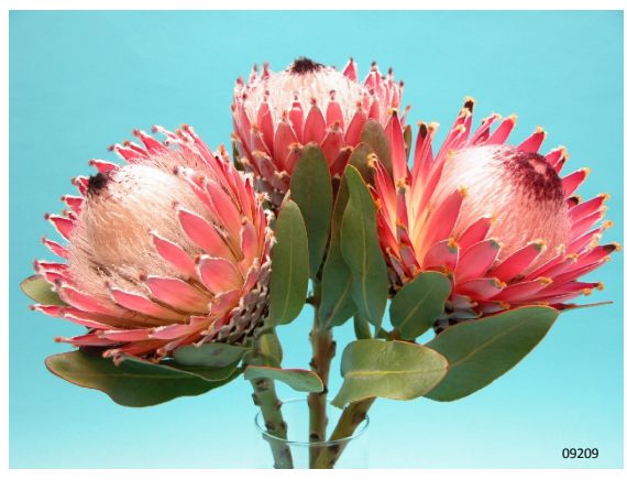
Treatment: Chrysal Clear Professional 3 liquid Total vase life: 20 days Photo taken: day 13