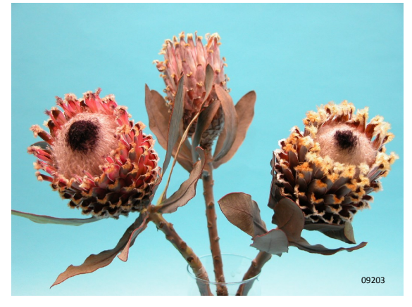
Treatment: water Total vase life: 12 days Photo taken: day 13