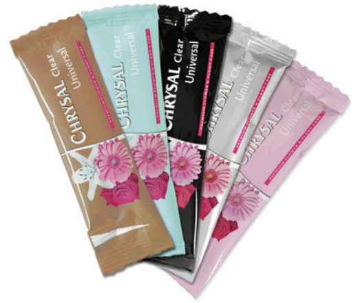
Trend Selection for a perfect match!