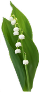
LILY OF THE VALLEY