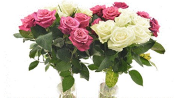
Treatment: Chrysal 99% Bio Based Rosa Total vase life: 18 days Photo taken: day 15