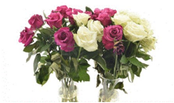
Treatment: water Total vase life: 15 days Photo taken: day 15