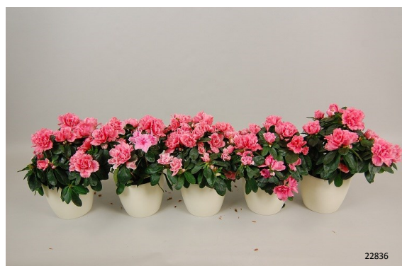
Chrysal Aqua Pad Photo taken: day 7