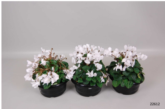
Control Photo taken: day 10