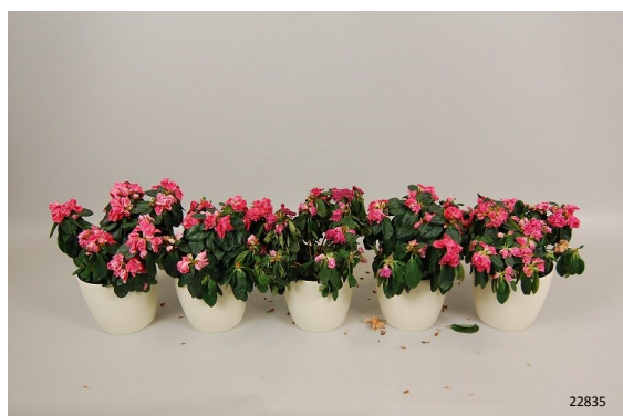
Control Photo taken: day 7