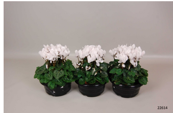
Chrysal Aqua Pad Photo taken: day 10