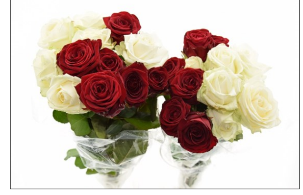
Chrysal Arrive Alive<sup>®</sup> Eco + Chrysal Professional 2