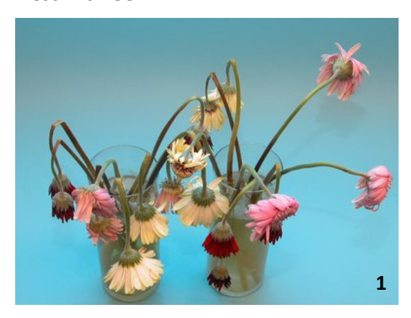
1 = water