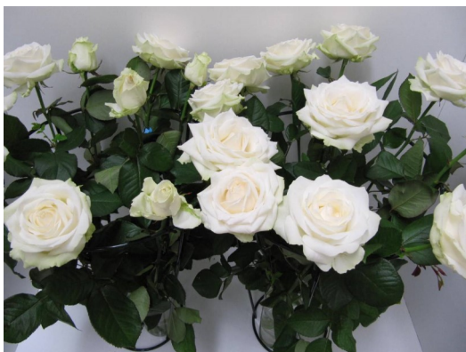
Treatment: water during transport, shop and consumer phase