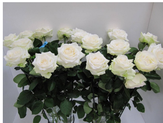
Treatment: Chrysal Grow 30 as post-harvest treatment and during transport / water during shop and consumer phase