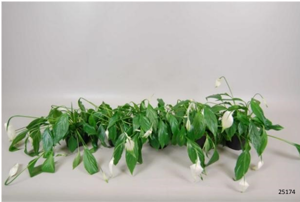
Control Photo taken: day 8