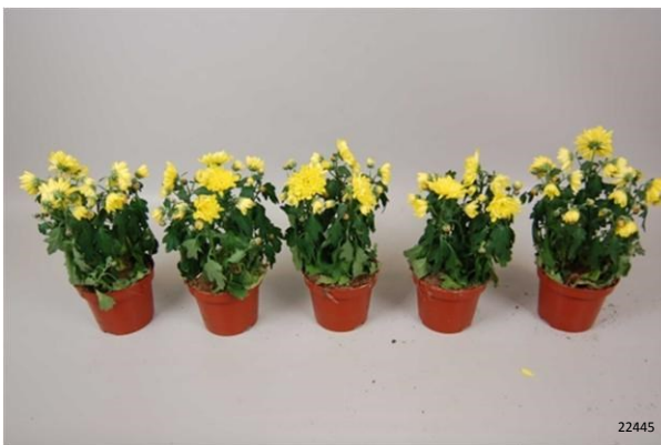
Control Photo taken: day 14