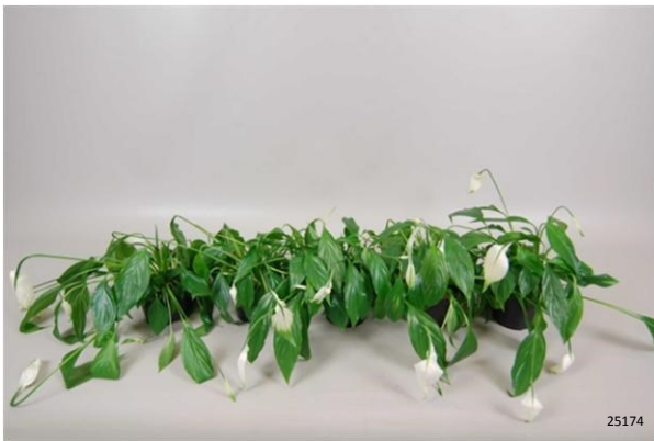
Control Photo taken: day 8