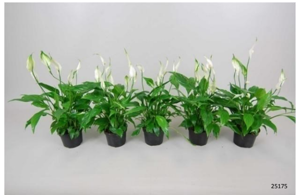
Treatment: Chrysal LeafShine & Seal Photo taken: day 8