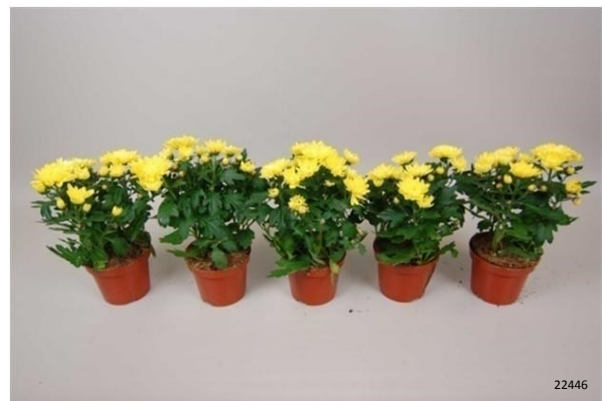
Treatment: Chrysal LeafShine & Seal Photo taken: day 14