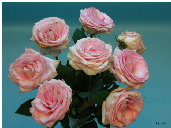
Treatment: Chrysal RVB Clear Intensive Total vase life: 15 days Photo taken: day 12