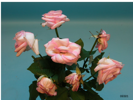
Treatment: water Total vase life: 12 days Photo taken: day 12