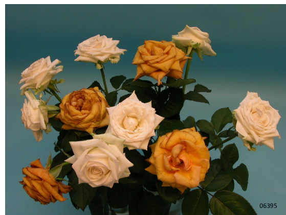
Treatment: Chrysal RVB Clear Intensive Total vase life: 11 days Photo taken: day 11