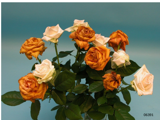
Treatment: water Total vase life: 8 days Photo taken: day 11