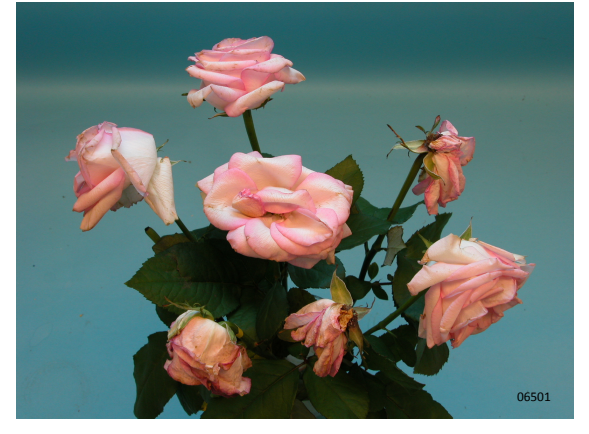
Treatment: water Total vase life: 12 days Photo taken: day 12