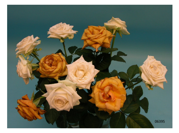
Treatment: Chrysal RVB Clear Intensive Total vase life: 11 days Photo taken: day 11

Chrysal International BV, Gooimeer 7, 1411 DD Naarden, P.O. Box 5300, 1410 AH Naarden, The Netherlands. T: +31 (0)35 69 55 888, F: +31 (0)35 69 55822, E: info@chrysal.nl, www.chrysal.com