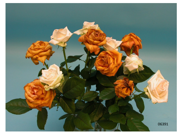
Treatment: water Total vase life: 8 days Photo taken: day 11