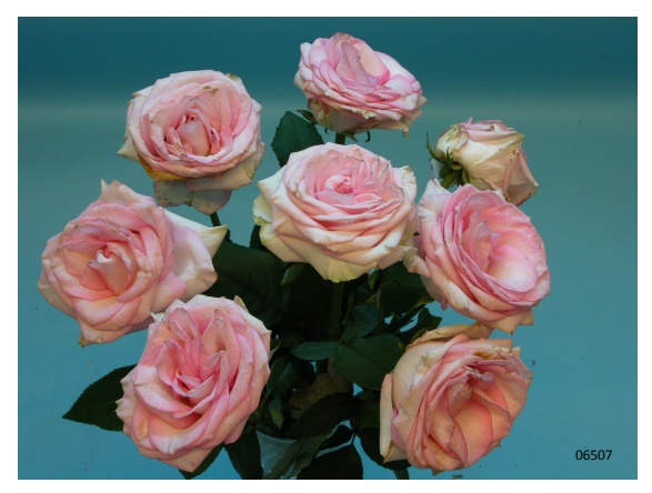
Treatment: Chrysal RVB Clear Intensive Total vase life: 15 days Photo taken: day 12