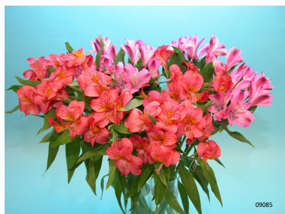
Treatment: Chrysal AVB and Chrysal SVB Total vase life: 15 days Photo taken: day 13