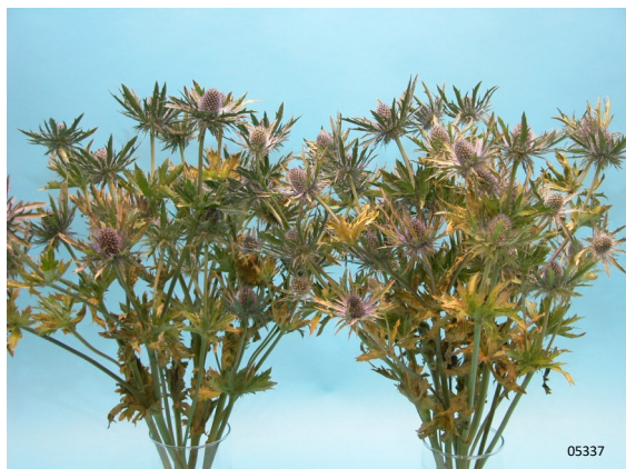
Treatment: water Total vase life: 10 days Photo taken: day 15