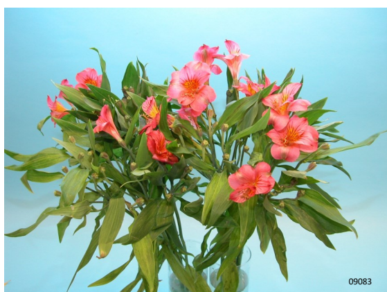
Treatment: water Total vase life: 11 days Photo taken: day 13