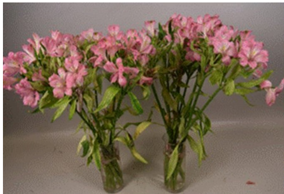
Alstroemeria 'Posh Pink' – Day 14