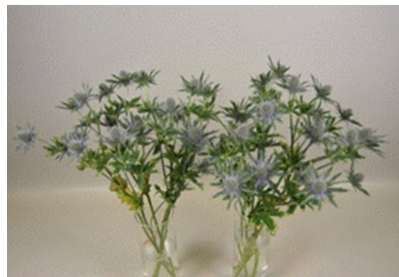
Eryngium 'Orion' – Day 14