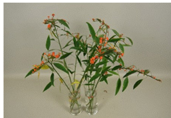
Euphorbia fulgens 'Orange Queen' – Day 7