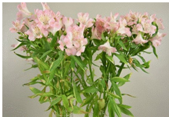
Alstroemeria 'Wonder Sweet' – Day 18