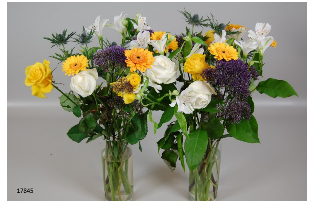
Treatment: water Total vase life: 10 days Photo taken: day 10