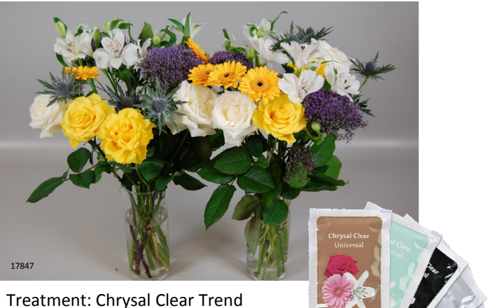
Treatment: Chrysal Clear Trend Selection Universal powder Total vase life: 14 days Photo taken: day 10