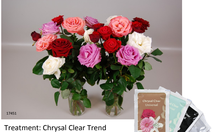
Treatment: Chrysal Clear Trend Selection Universal powder Total vase life: 13 days Photo taken: day 10