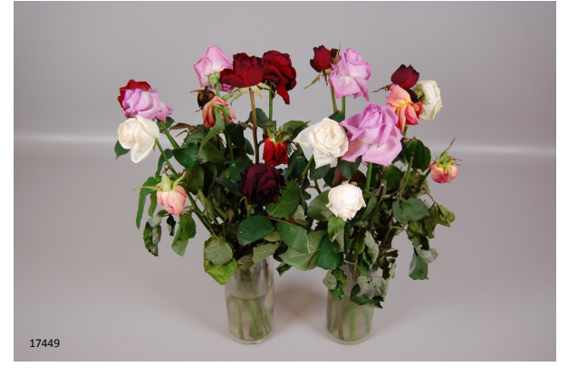
Treatment: water Total vase life: 7 days Photo taken: day 10