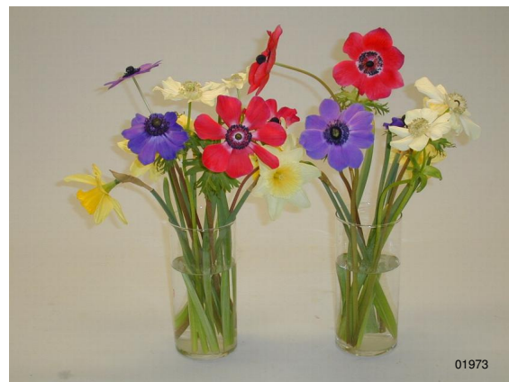
Treatment: Chrysal Clear Narcissus Total vase life: 10 days Photo taken: day 7