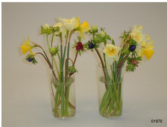
Treatment: water Total vase life: 8 days Photo taken: day 7