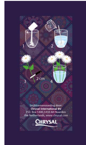
Figure 3. Example your own design – Portrait reverse

Remember; use the same colour in the outer frame as on the front of the sachet.