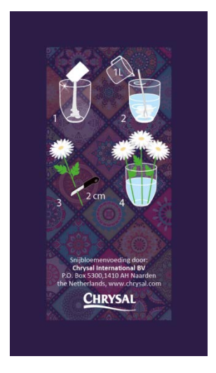
Figure 3. Example your own design – Portrait reverse

Remember; use the same colour in the outer frame as on the front of the sachet.