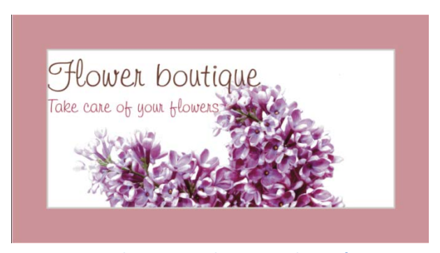
Figure 2. Example your own design—Landscape front