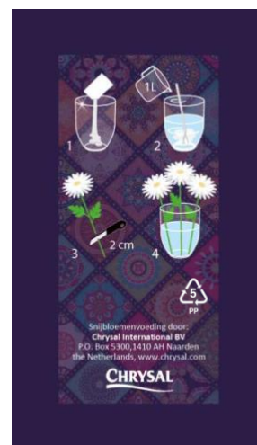
Figure 3. Example your own design – Portrait reverse

Remember: use the same color in the outer frame as on the front of the sachet.