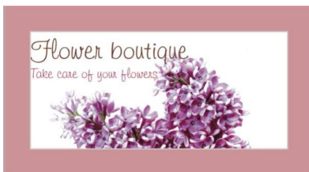
Figure 2. Example your own design– Landscape front