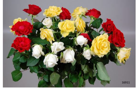
Treatment: water Total vase life: 8 days Photo taken: day 8