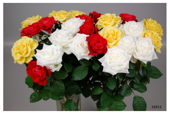
Treatment: Chrysal Clear Fairtrade rose liquid Total vase life: 15 days Photo taken: day 8